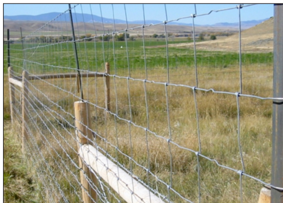
Mesh fence extension on top of existing livestock containment fence.

Protect young trees from browse and scrape damage by wrapping them with Vexar®, Tubex®, plastic tree wrap or woven-wire cylinders. Usually a four-foot-high woven-wire cylinder will keep deer from rubbing tree trunks with antlers.