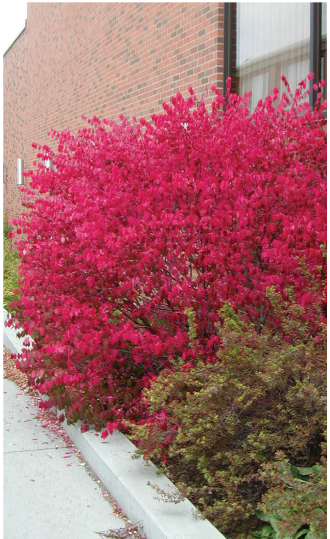
Burning Bush ( Euonymus spp.) BY CHERYL MOORE-GOUGH