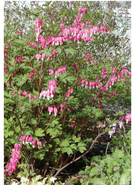
Bleeding Heart ( Dicentra spp.) BY CHERYL MOORE-GOUGH