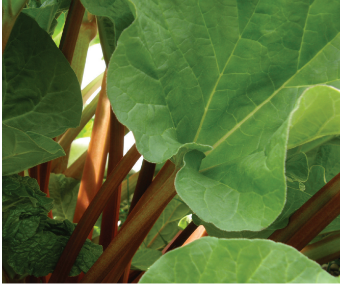
Rhubarb ( Rheum rhabarbarum ) BY CHERYL MOORE-GOUGH