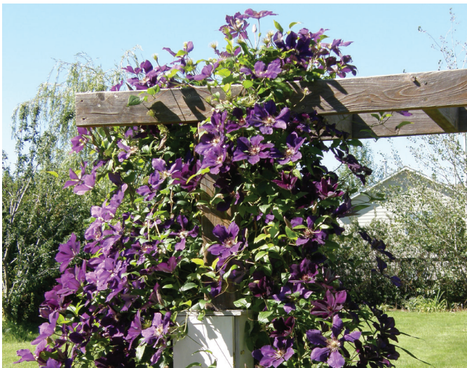
Clematis ( Clematis spp.) BY CHERYL MOORE-GOUGH