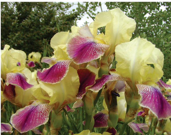
Iris ( Iris spp.) BY CHERYL MOORE-GOUGH