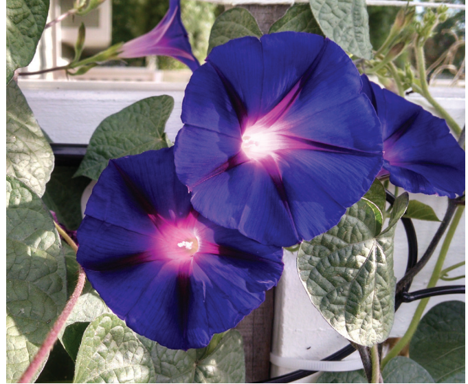
Morning Glory ( Ipomoea spp.) BY CHERYL MOORE-GOUGH