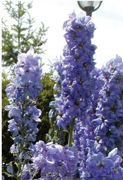
Larkspur ( Delphinium spp.) BY CHERYL MOORE-GOUGH