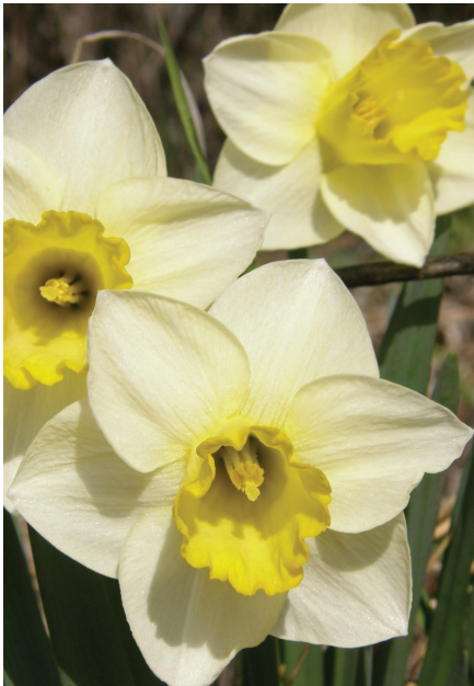
Daffodil ( Narcissus spp.) BY CHERYL MOORE-GOUGH

Many range plants not commonly found around the home landscape are also toxic. See MSU Extension Bulletin 122, Range Plants of Montana , for more information on toxic range plants.