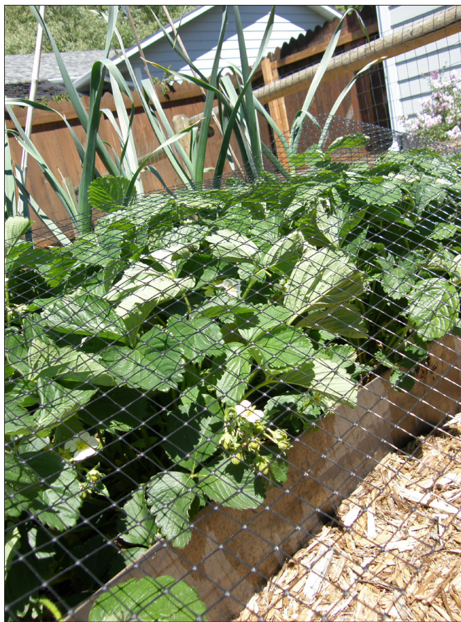
FIGURE 12. Protect berries with bird netting.

Damp weather and heavy foliage favor the disease. Proper spacing and avoiding heavy matted rows allow air movement around plants. Applying nitrogen in summer and fall rather than in spring will also help reduce development of gray mold. Mulch, if not too heavy, can help isolate the berry from the soil or decaying vegetation.