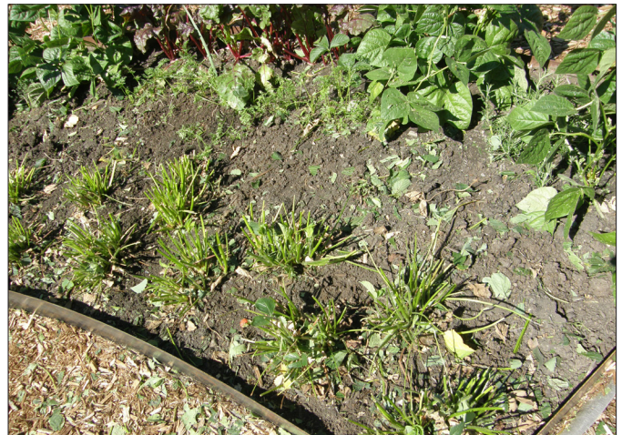
FIGURE 8. After fruiting, renovate June bearing plants by cutting the plants back to 4" stubs.

Plastic mulches don't allow for easy rooting of daughter plants. If using straw, be certain it is weed-seed free.