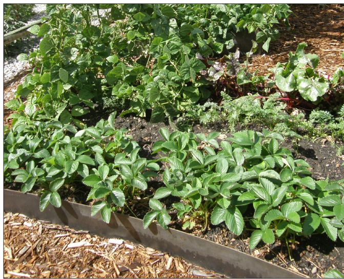
FIGURE 10. New growth should occur within two weeks.