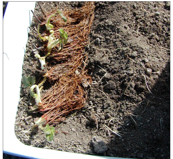
FIGURE 4. Dig a shallow trench then cover the roots to hold. Keep moist.

Many local nurseries stock a selection of strawberry plants in spring, but a greater variety is offered online. If new plants arrive before conditions are right for spring planting, hold them in the refrigerator wrapped in moist packing material to reduce drying. If that is not an option, plant them in a temporary spot in a shaded area (“heel them in”) until planting: place the newly arrived plantlets in a bucket of water (Figure 2), then gently tease roots apart (Figure 3). Dig a shallow trench in a bin of soil and lay the plantlets along the trench. Cover the roots with soil and keep moist in a protected location until transplant time (Figure 4).