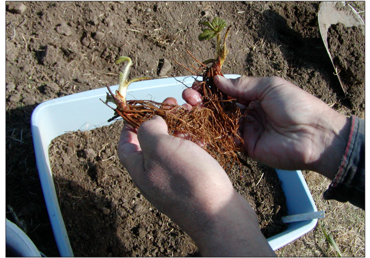
FIGURE 3. The second step is to separate plantlet roots.

There are several planting options for very limited space. Special “strawberry pots” have small openings in their sides where plants are set. Wooden whiskey barrels may also be used by boring two-inch holes in their sides. Be sure to bore a hole or two in the bottom of the barrel for drainage. Planting in an upended and modified wooden shipping pallet is another option (Figure 1, page 1). Another way to save space is to plant into a pyramid made up of several metal rings, wooden terraces or pots, decreasing in size from ground level to the highest tier. Make each level 12 inches smaller than the one beneath it so that, by centering it on the lower one, you allow six inches of level soil for plant growth in each tier.