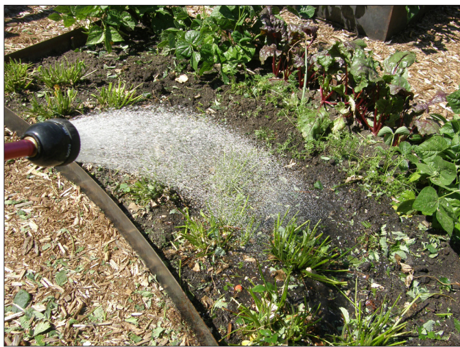
FIGURE 9. After cutting back the plants, fertilize and water well.

Verticillium wilt. This soil-borne fungus disease affects other garden plants and certain weeds, as well as strawberries. It's most active in cool weather when fruit is setting.