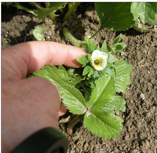
FIGURE 11. Frost damage to a flower will result in no berry being produced. Remove these flowers.

Control measures include close examination (roots and cut crowns) of plants at planting for damage, and proper fertilization to promote vigorous growth. Keep roots from drying out during planting and set plants to the appropriate depth. Changing planting location within the garden every few years helps avoid resident pathogens that could infect new plants. Plant new plants when vigor begins to decline.