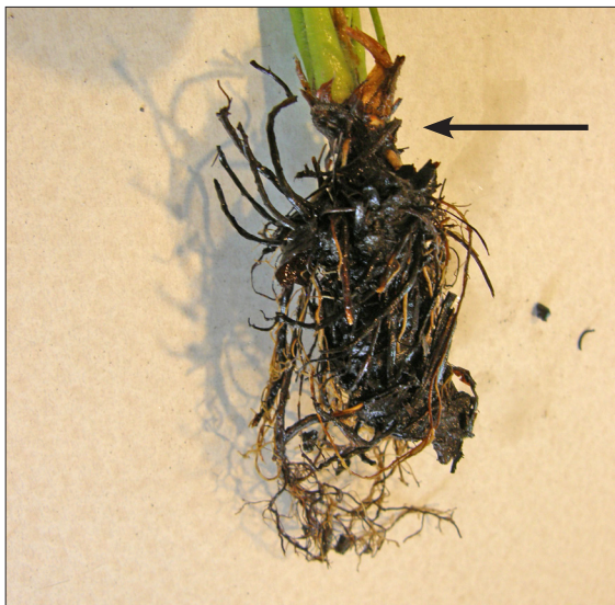
FIGURE 6. Set new plantlets in the garden with their crowns at soil level. Take care to not plant too deeply nor too shallow.

With June bearing cultivars, remove all flowering stalks that develop during the first season as soon as they appear. Letting new plants fruit before they have become established will permanently reduce their vigor and productivity. Remove the first flower stalks to appear on everbearing cultivars. These would produce the first crop of the season. If plants become well-established and appear vigorous, let the plants produce the second crop (fall crop) in the first season. For day neutral cultivars, remove blossoms for the first few weeks after planting, then let the plants produce for the remainder of the season.