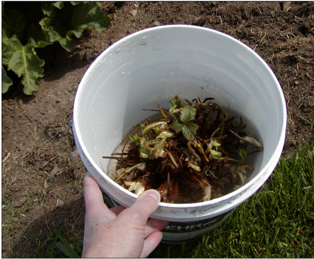
FIGURE 2. The first step in heeling in plantlets that arrive too early to plant is to soak them in water.