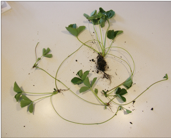
FIGURE 7. Most varieties will produce runners, from which daughter plants will grow and root.

Scout daily once fruit is ripening. Some varieties ripen from the stem end to the tip, while others ripen from the tip to the stem end. Harvest when fruit is completely red before the birds discover them.