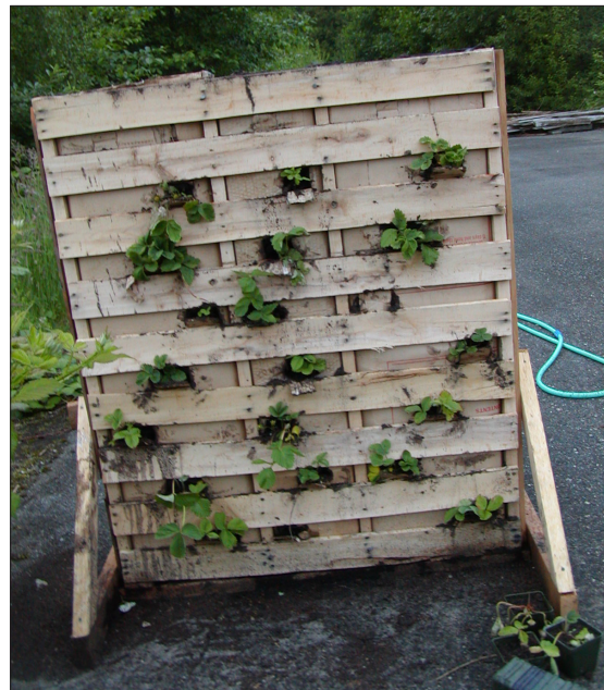
FIGURE 1. An upended and modified shipping pallet may be used as a planter to save space.

Work rotted manure or compost into soil to improve its structure and water-holding capacity. Form soil beds 36 inches wide and three to four inches above grade to assure good soil drainage.