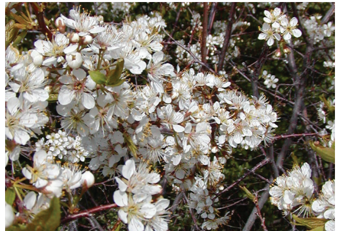
American Plum Flowers ( Prunus americana ) BY CHERYL MOORE-GOUGH

Group 3 contains very hardy, drought-resistant, late-blooming hybrids of either the native or Japanese plums and P. besseyi . These are sometimes called the Cherry-Plum or Plum-Cherry hybrids. The plants come into bearing and their fruit ripens early, and the fruit has better flavor than those of the native plums. The plants are generally short-lived (eight to 10 years), poor pollen producers, and self-sterile, and bear small fruit with poor keeping quality. 'Oka,' 'Opata' and 'Compass' are the hardiest cultivars. Since this group bears on one-year-old wood, winterkill can be a problem. Sunscald may also be a problem in some areas, particularly on plants trained to tree form.