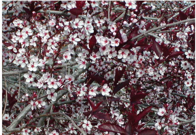
Purple-Leaf Sandcherry ( Prunus x cistena ) BY CHERYL MOORE-GOUGH

P. fruticosa Pall. European dwarf cherry, European ground cherry, Siberian dwarf cherry. This is a bush up to 10 feet high that bears sour red to purple fruit about a quarter-inch in diameter. It is native to Europe and Siberia