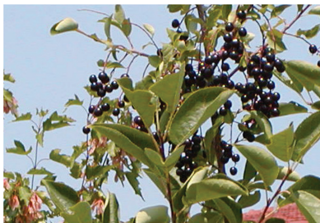
Chokecherries ( Prunus virginiana ) BY CHERYL MOORE-GOUGH

The chokecherry is self-fruitful (that is, it will set fruit by its own pollen) and insect-pollinated, with daytime temperatures below 86°F and cool nights favoring fruit set. The use of a different cultivar for every tenth plant in the row, and supplemental honeybees, may improve fruit set. Plants rarely begin to fruit in their second year, though the first good fruit set usually occurs before the fourth year.