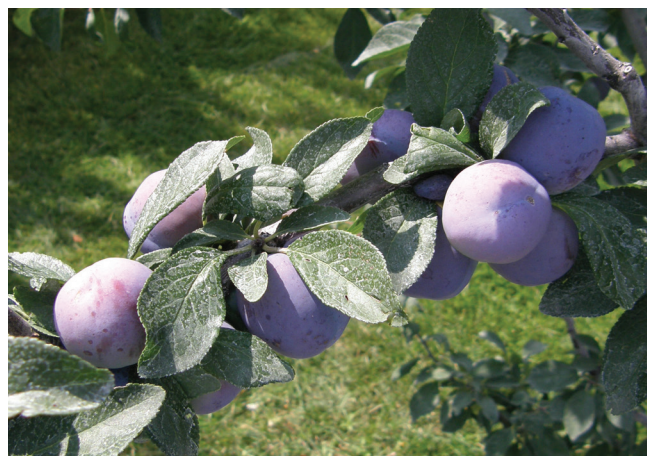
Plums ( Prunus sp.) BY CHERYL MOORE-GOUGH

Plums of commercial importance are tree type and involve species not discussed below, except as they may be involved in some hybrid forms. Bush-type plums are useful for homeowners and small farmers in the northern plains because they display good hardiness and relatively good production under Montana conditions. They fall into three groups that stretch across species lines.